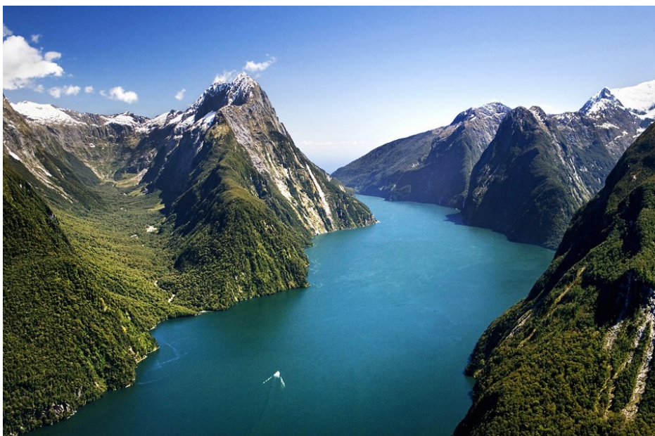
Milford Sound Fiord

On the 9th December, my family and I will travel across the world to the beautiful countries of New Zealand and Australia. We will fly to Abu Dhabi, Sydney and Auckland with Etihad. We have our trip all planned out with destinations including Auckland, Rotorua, Napier, Wellington, Nelson, Wanaka, Queenstown, Melbourne, Ayers Rock and Sydney. We are away for a total of 5 weeks and return to Dublin on the 12th January. We have many activities planned for the holiday, including sea kayaking in Abel Tasman National Park in Nelson, going to Milford Sound, which is a fiord, Franz Joseph Glacier and zip lining in Queenstown. In Australia we are going to drive along the Ocean Road to see the 12 Apostles which