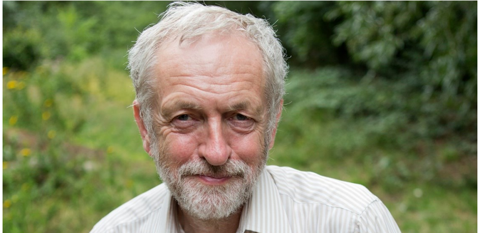
Jeremy Corbyn is the new leader of the Labour Party

On 12 September 2015, Jeremy Corbyn became leader of the Labour Party in the UK, succeeding Ed Miliband after he failed to get elected as Prime Minister. There has been widespread discussion about him in the media, as he is relatively new to mainstream media. Corbyn was born on 26 May 1949 in Wiltshire, the youngest of four sons. In his younger years he was an activist and has been awarded for his work. He became Islington North's MP in 1983. He is known for his left-wing and socialist policies. One of Corbyn's most controversial incidents was in 1984 when he invited IRA members to the House of Commons. He has been criticized by the families of those who have been hurt by the IRA for refusing to condemn the group for their activities. When asked if he condemned them, he has often ignored the main points of the question and condemned the British instead. One of his policies that has clashed with the views of