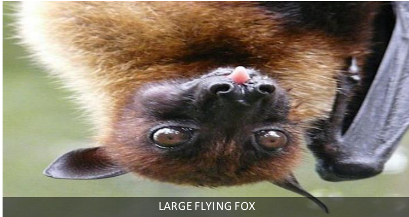
LARGE FLYING FOX