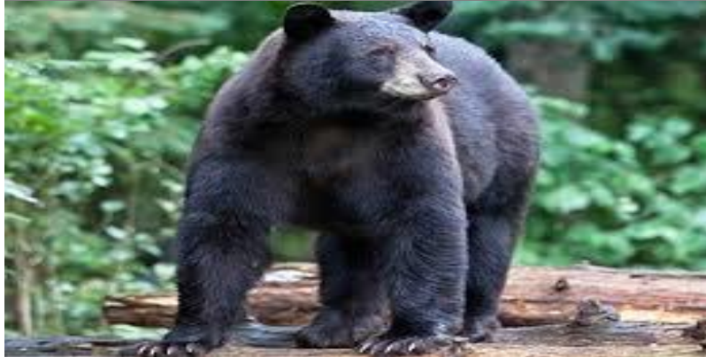
AMERICAN BLACK BEAR