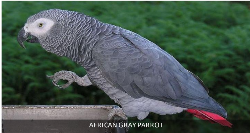
AFRICAN GRAY PARROT