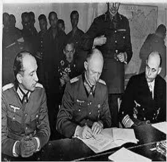
Alfred Jodl, German chief of the operations staff of the Armed Forces High Command, signs an unconditional "Act of Military Surrender" and ceasefire.

The German Surrender was the legal document that started the extinction of the Nazi party and ended World War II in Europe. Donitz's representative, Admiral Hans-Georg von Friedeburg, informed him on 6 May that Eisenhower was now insisting on immediate surrender. The Reims signing ceremony was attended by many reporters on the 8 th of May at 21.00. Western Allies would celebrate Victory in Europe Day on the 8 th of May. Marshal Wilhelm Keitel was one of the first people to sign the surrender for Berlin The signing in Berlin took place on the 9 th of May at 00.16 local time. But in Moscow time the Reims signing, and the Berlin were all on the same day.